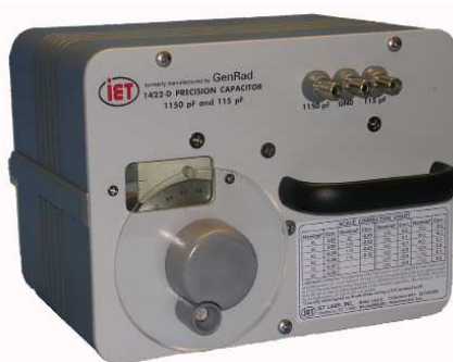
Model 1422-D Precision Capacitor