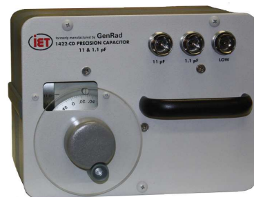
Model 1422-CD Precision Capacitor

Accuracy - The errors tabulated in the specifications are possible errors, i.e., the sum of error contributions from setting, adjustment, calibration, interpolation, and standards. When the capacitor is in its normal position with the panel horizontal, the actual errors are almost always smaller. The accuracy is improved when the readings are corrected using the 12 calibrated values of capacitance given on the correction chart on the capacitor panel and interpolating linearly between calibrated points. Even better accuracy can be obtained from a precision calibration of approximately 100 points on the capacitor dial, which permits correction for slight residual eccentricities of the worm drive and requires interpolation over only short intervals. This precision calibration is available for the 1422-CL model.