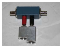
1422D-1693 Adapter included with 1422-D