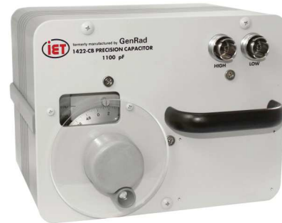
Model 1422-CB/CL/CC Precision Capacitor

Stator insulation in all models is a cross-linked thermosetting modified polystyrene having low dielectric losses and very high insulation resistance. Rotor insulation, where used (Types 1422-CB and -CL), is grade L-4 steatite, silicone treated.