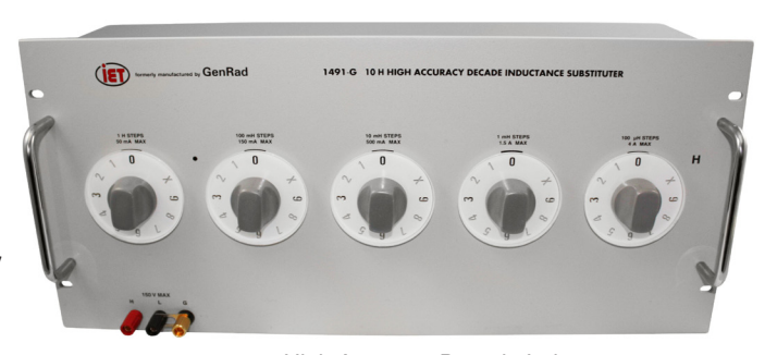
1491 High Accuracy Decade Inductor