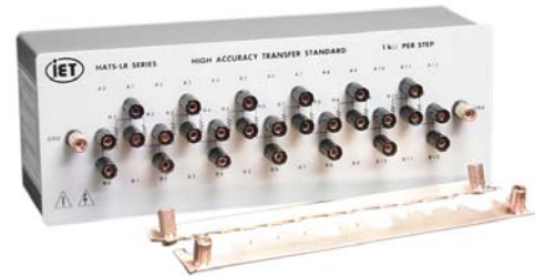
Model HATS-LR-10 Transfer Standard with SB103 shorting bars

The HATS-LR Series of transfer standards consist of 12 matched resistors, of value R, which may be connected in series or parallel combinations to produce any number of values such as R/10, R, and 10R, all with the same known deviation, thereby allowing progressive transfers to higher and lower decades. For example, the 10 k \Omega transfer standard may be used to transfer calibrations across 1 k \Omega , 10 k \Omega and 100 k \Omega .