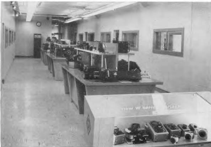
Instrument display area in the Sales Engineering Department.

terial. For instance, raw aluminum sheets are now received, cut to panel size, and stored in the same area of the first floor. Similarly, a panel is cleaned, painted, and engraved all in one area. Machine tool sections are arranged as logically: a metal cabinet is punched, drilled, formed, welded, and sanded all at one end of the department. Parts manufacture and processing operations (machine shop, painting, plating, etc.) feed, from their first- and third-floor corners, the centralized second-floor stockroom and Assembly Department. The machined