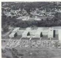
Airplane view of the new General Radio Plant.