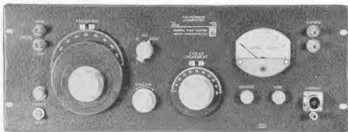
The new-look panel, charcoal gray, with black dials, light-gray knobs. Proprietary meter design yields maximum scale length for panel space occupied.

General Radio's relay-rack design is used for fairly large instruments. These instruments can be mounted in standard 19-inch relay racks, with front and rear accessibility to the interior of the instrument without complete removal from the rack. Although designed primarily for rack mounting, they can also be supplied with different hardware for use out of the relay rack, on a bench or stacked one above another in a quasi-relay-rack assembly.