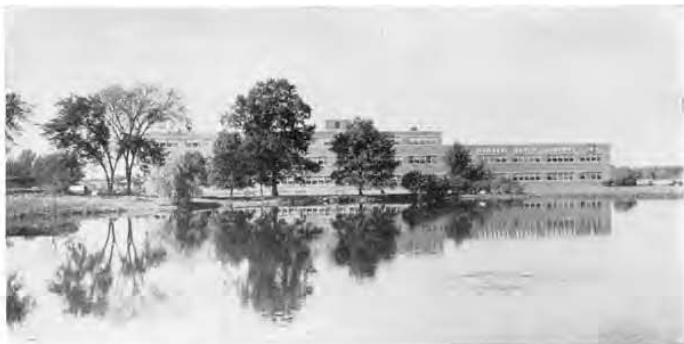
General Radio's Walden.