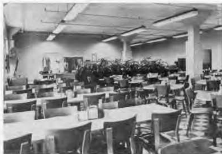
View of a section of the spacious employees' cafeteria.

General Radio's new home is a smart, three-story, brick complex of 293,000 square feet (about twice the size of our Cambridge plant). The building configuration is a series of H's (see cover photo), planned so that every office is an outside office. Around the building are a small fish pond (mostly black bass, with some perch and pickerel), a 600-car parking lot, and a well-groomed outfield (the word is apt; the grass mixture is the same as that used at Fenway Park). State Route 2, the Mohawk Trail from