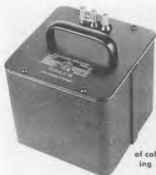
Standard inductor shows laboratory-bench type of cabinet with locking strip at side.

metal boxes, whereas larger units are housed in heavy-gauge aluminum enclosures. These enclosures are fabricated from sawed or extruded plates and held together by locking strips. Rugged construction, electrical shielding, and pleasing appearance are combined in these cases.