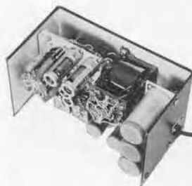
Unit-type construction uses U-shaped chassis, as shown here; mating U-shaped piece provides dust cover and complete enclosure.

A one-piece drawn-aluminum instrument case and control-panel cover results in a lightweight yet sturdy enclosure. The control-panel cover serves as storage space for accessories, and functions as a base when the instrument is in operation. A rubber gasket around the edge of the control-panel cover seals the closed case. When the instrument is