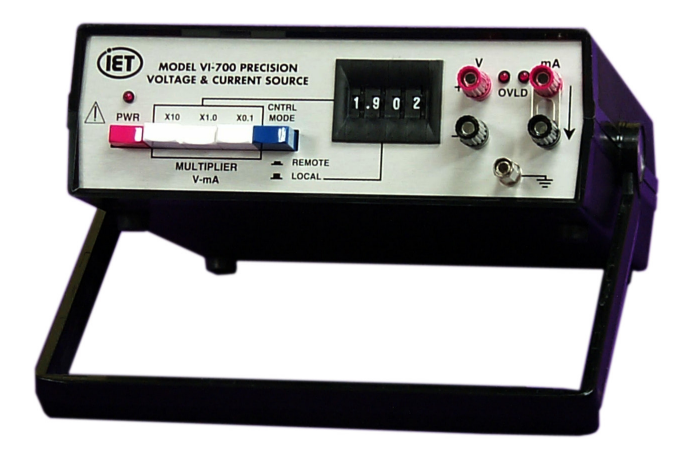
Figure 1.1: VI-700 Manual or Programmable Voltage and Current Source

Front panel overload indicator lamps warn of exceeding of voltage load or current compliance limits. This feature assures the user that the output is within specifications without having to make any measurement or computations. The standard model may still be used within the overload condition and will function for approximately 50-100% overload with only a slight degradation of specifications.