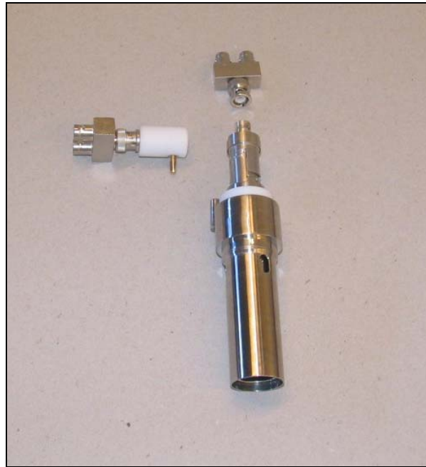
Figure 3: Typical Liquid Cell

Dielectric cells are manufactured by a number of companies. The dielectric cells shown in this application note are manufactured by Dielectric Products Company of Watertown, MA. QuadTech LCR Meters have been tested with these dielectric cells. The dielectric cells and LCR meters described in this application note are available directly from IET Labs. Please see www.ietlabs.com for ordering information.