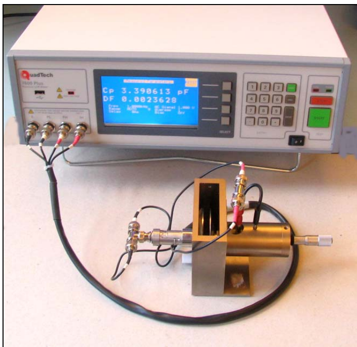
Figure 2. 7600 Precision LCR Meter with Rigid Dielectric Cell

The dielectric constant measurement, also known as relative permittivity is one of the most popular methods of evaluating insulators such as rubber, plastics, powders and other materials. It is used to determine the ability of an insulator to store electrical energy. Dielectric constant measurements can be performed easier and faster than chemical or physical analysis techniques making them an excellent material analysis tool. The dielectric constant is defined as the ratio of the capacitance of the material to the capacitance of air.